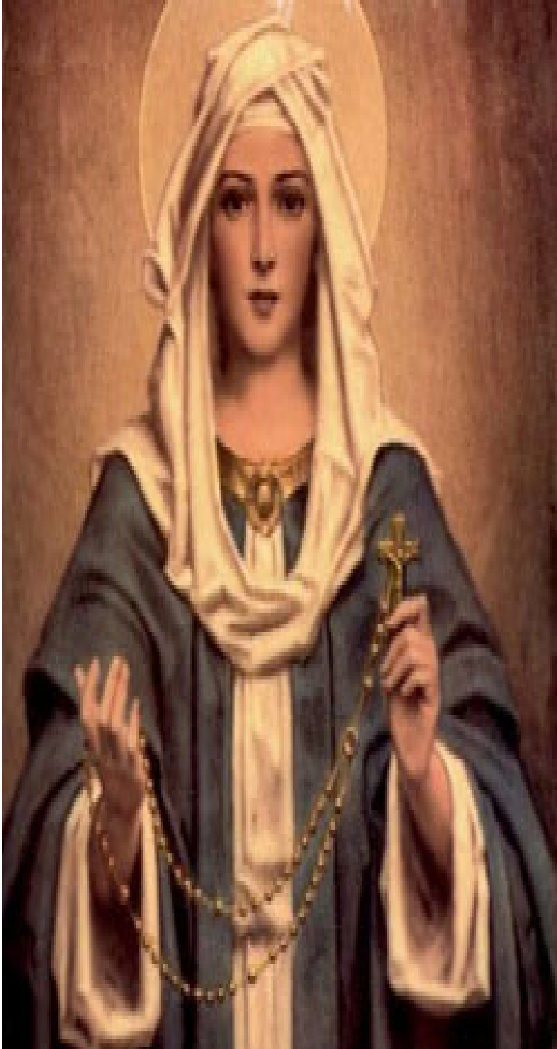
Our Lady of the Rosary

806 North Washington Street, Kaufman, Texas 75142 • (972) 962-3247 Office Hours: Monday - Thursday 9:00 a.m.-4:00 p.m., Friday 9:00 a.m.-12:00 non Fax: 972-932-4003 • sapkau@mycvc.net • www.stannkaufman.org