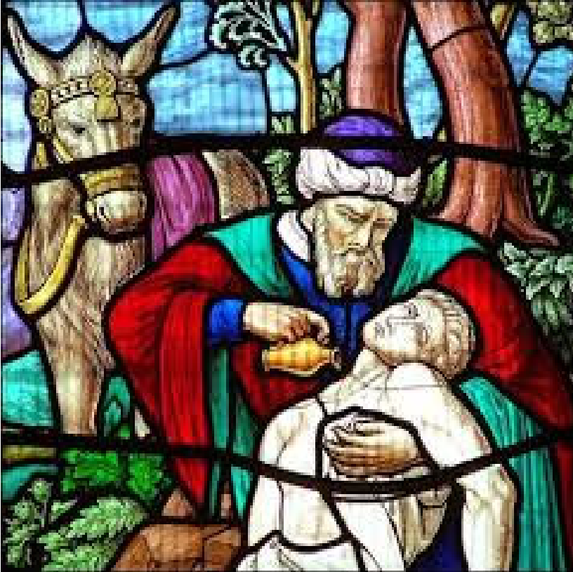
St. Ann Catholic Church Mission Statement

806 North Washington Street, Kaufman, Texas 75142 • (972) 962-3247 Office Hours: Monday - Thursday 9:00 a.m.-4:00 p.m., Friday 9:00 a.m.-12:00 non Fax: 972-932-4003 • sapkau@mycvc.net • www.stannkaufman.org